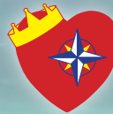
Respect for self-determination

Education is about perfecting self and society. Across time and cultures, scholars and thinkers have said so in many ways. The Circle School agrees, stating its ideal this way: “Children and youth practice personal fulfillment and engagement in society ...” (from Ends We Seek).